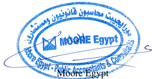
MOORE Egypt Public Accountants & Consultants